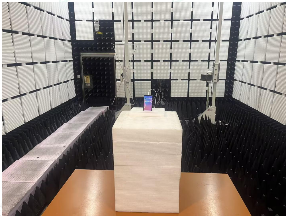
Spurious Emission below 1GHz & above 1GHz